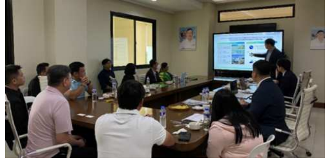
▲ Location map of Badr, Egypt(Project Site)

The “KCN pre-consulting” project was newly established in accordance with the K-City Network improvement plan (Oct. '23) by the National Smart City Committee. The purpose of the preliminary consulting is to enhance the sustainability of the main consulting projects and identify potential follow-up projects. This is achieved by conducting consultations with counterpart institutions in the respective countries to discuss the scope of work and the development conditions of the project site in advance.