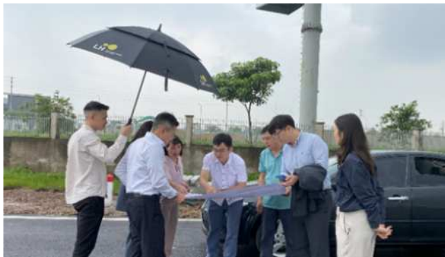
▲ K-City Network Egypt Badr Project Interim Report

The KCN preliminary consulting was selected through preliminary reviews among the 17 projects submitted as candidates for the 2024 KCN projects. In May, the KCN secretariat visited the People’s Committee of Hà Nam Province in Vietnam and the government of West Java in Indonesia. In June, the secretariat visited Bacoor City in the Philippines to assess the development conditions of the project sites and discuss the scope of work with project stakeholders.